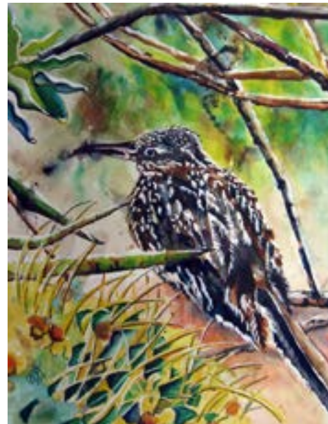
Artist: Beth Akey Watercolor Student